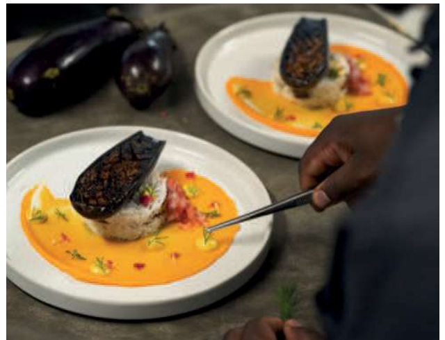
Below: A hearty roasted aubergine steak on coconut rice, paired with saffron cream and carrot purée, finished with a crisp rice cracker and a squeeze of lime